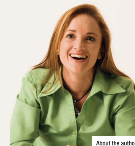
About the author

When you are stressed, it's probably a good idea to stay away from alcohol altogether. Dilute wine with soda water, have light beers and always have water or sugar-free cool drinks in between alcoholic drinks. Rest assured that you can wrap up 2009 in style, without compromising your health for wealth. Wishing you high energy, good health and successfully rewarding events! Looking forward to energising you again in 2010. 35